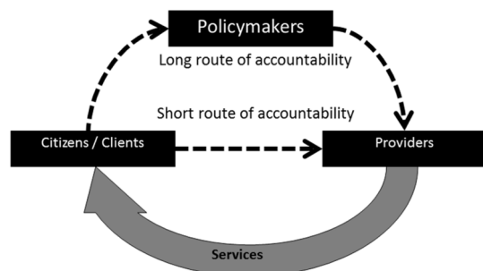
Figure 1 Governance and making services work for the poor.

with accountability mechanisms to monitor and assure progress on the decisions made. 7 Governing entities in the health sector can operate at different levels: global, national, subnational and local. The institutions responsible for implementation can be both formal, involving the public and non-state sectors, and informal, involving communities, work place and special interest groups. For health services, this process requires consideration of, as a minimum, three sets of actors and the relationship between them (see figure 1 ). 8 Citizens are the ‘clients’ of service providers and ideally should be able to hold the provider accountable for services. However, accountability more usually is expected to come through government’s and other agencies’ relationships with providers. This may involve insurance funds, professional bodies, academic and training schools, accreditation agencies, donors and international development partners.